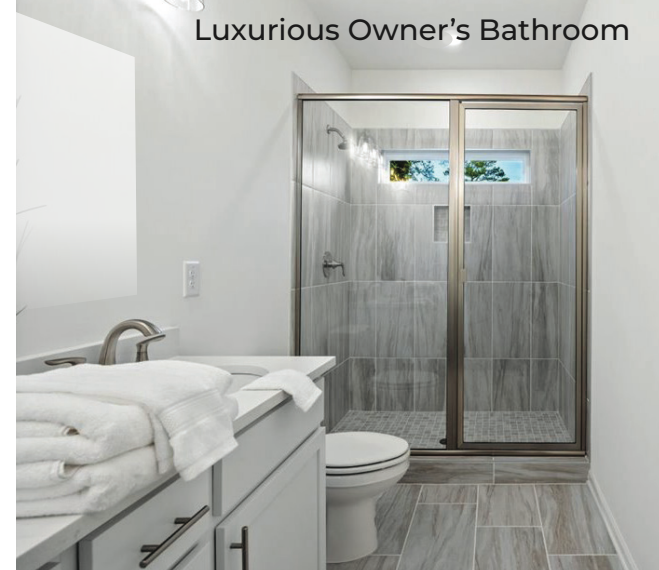
The owner's bath has a large walk-in tiled shower and matching floors with stylish fixtures and vanity.