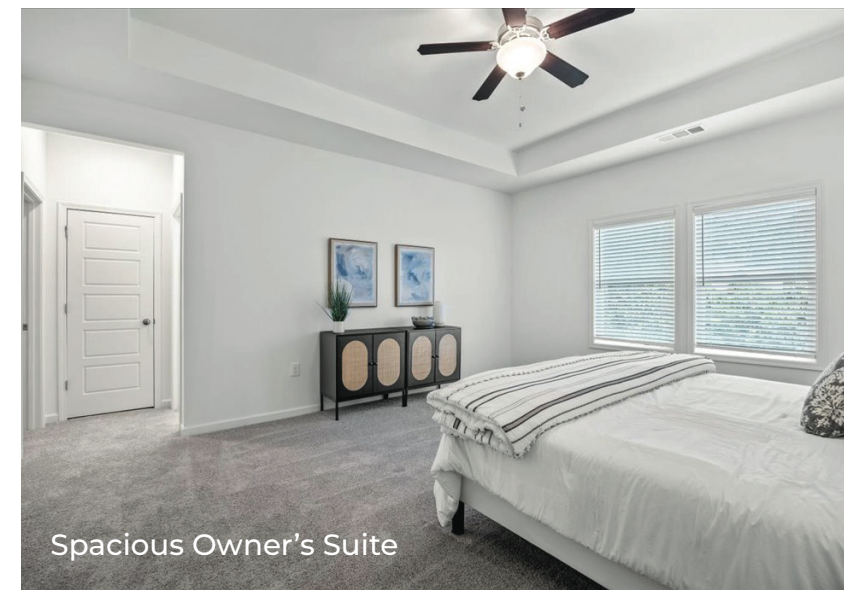
The owner's suite features private bath, a large walk-in closet that is conveniently connected to the laundry room.