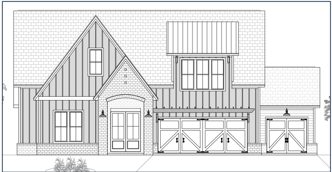
SCARLETT A - FRONT ENTRY - 3 CAR