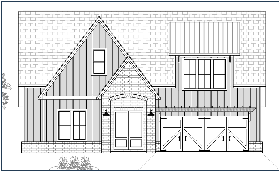
SCARLETT A - FRONT ENTRY