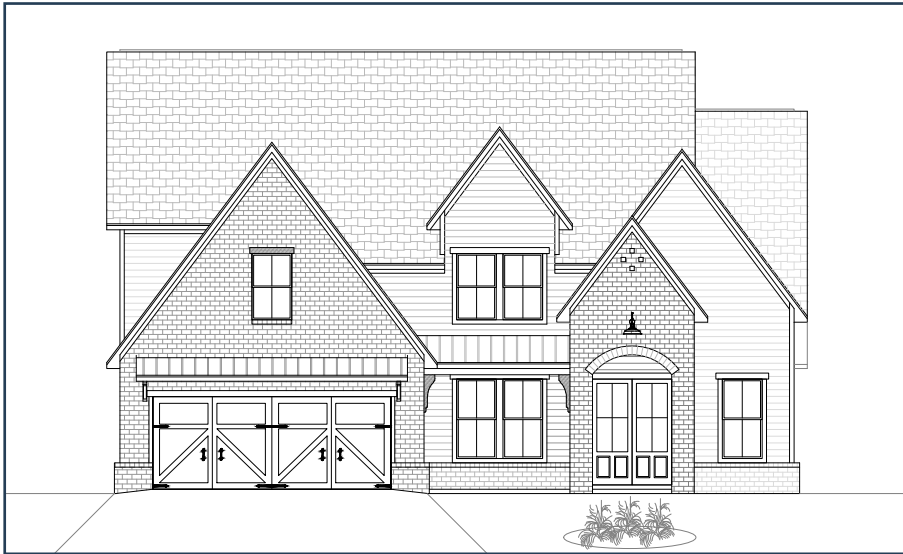
GRACELYN A - FRONT ENTRY