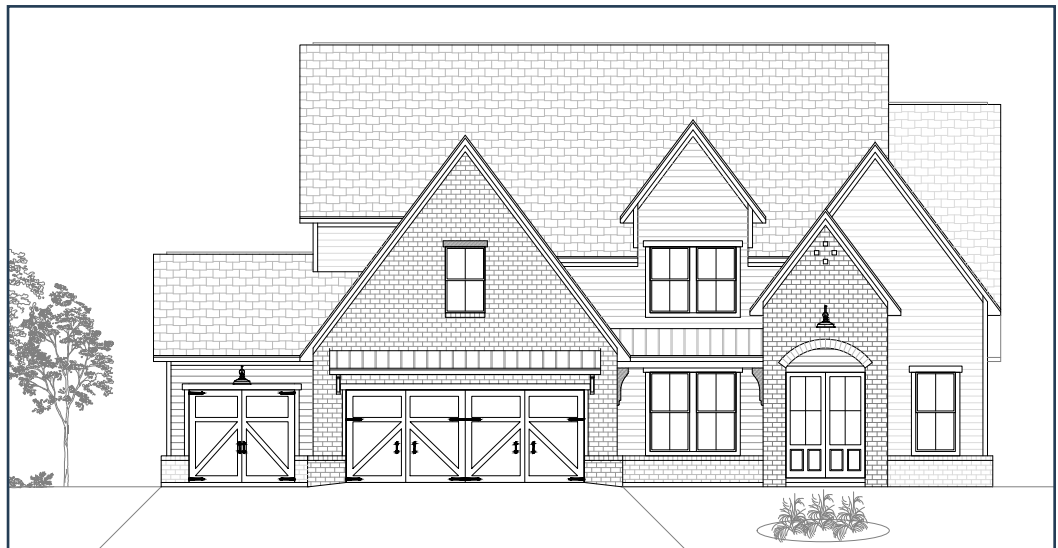
GRACELYN A - FRONT ENTRY - 3 CAR GARAGE