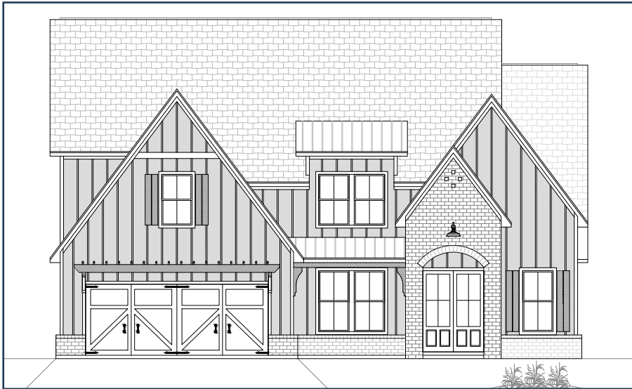
GRACELYN B - FRONT ENTRY