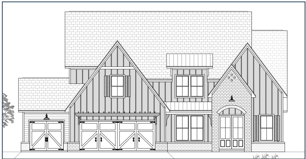
GRACELYN B - FRONT ENTRY - 3 CAR GARAGE